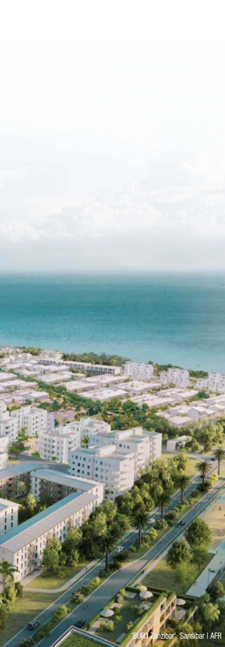
'BURJ Zanzibar', Sansibar | AFR