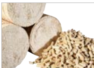
Briquettes | Pellets