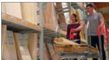
Solid wood products for the DIY store