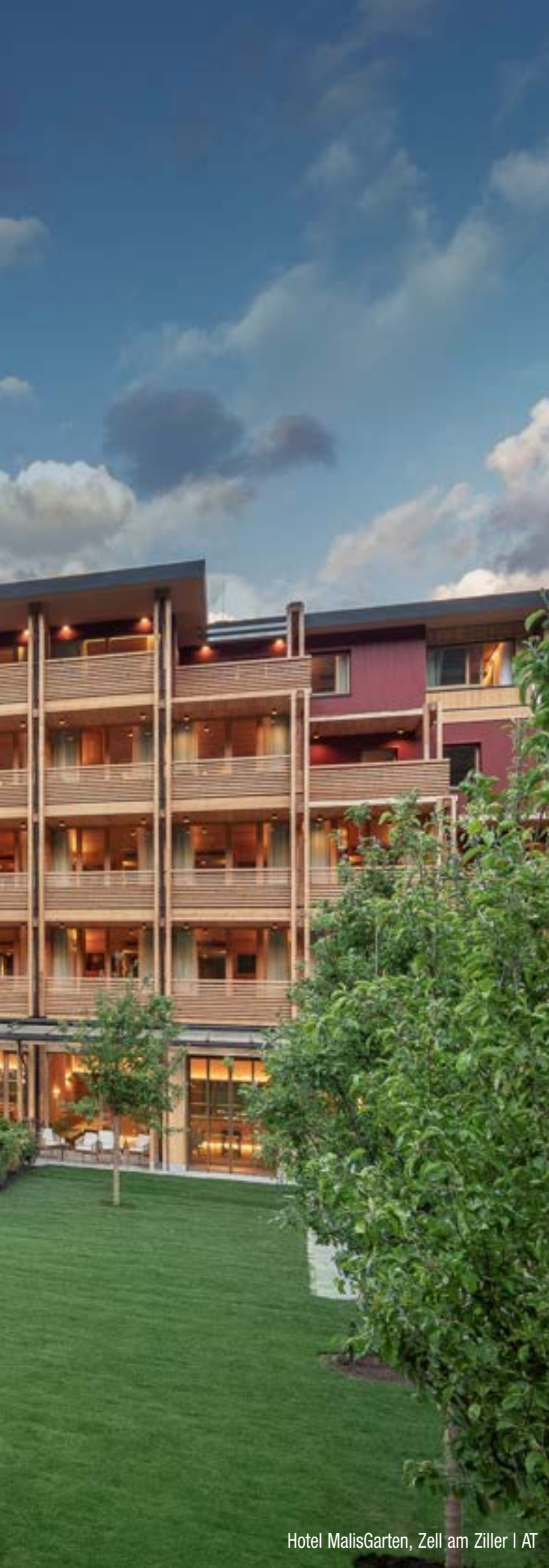
Hotel MalisGarten, Zell am Ziller | AT