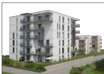
Solid wood system solutions for affordable living space