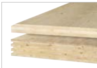
binderholz CLT BBS