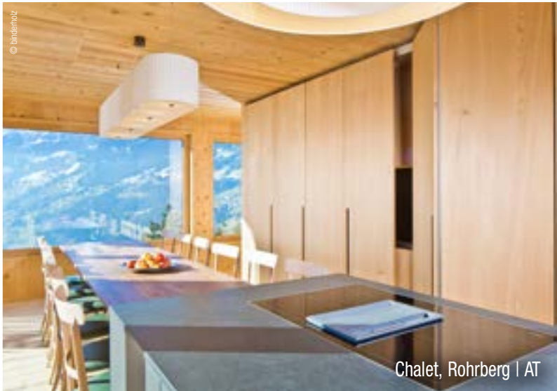
Chalet, Rohrberg | AT