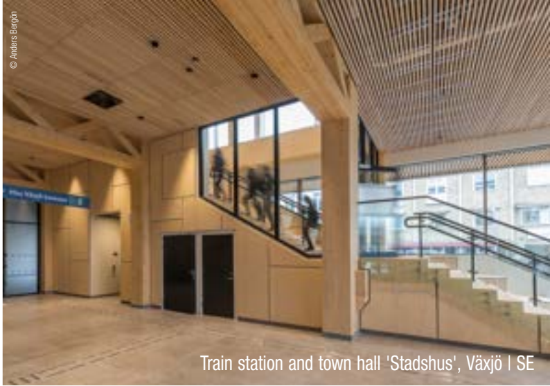
Train station and town hall 'Stadshus', Växjö | SE