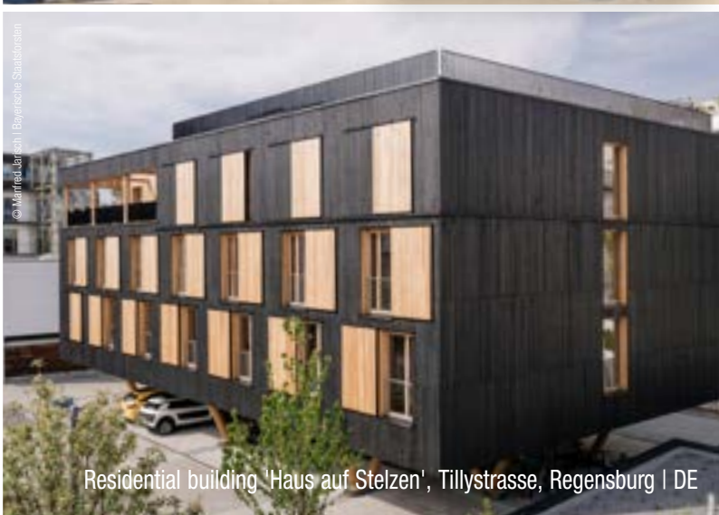
Residential building 'Haus auf Stelzen', Tillystrasse, Regensburg | DE