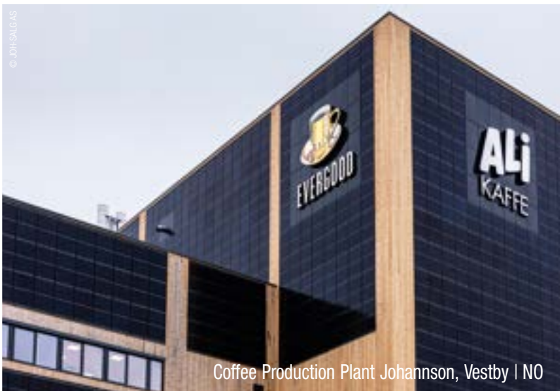
Coffee Production Plant Johansson, Vestby | NO