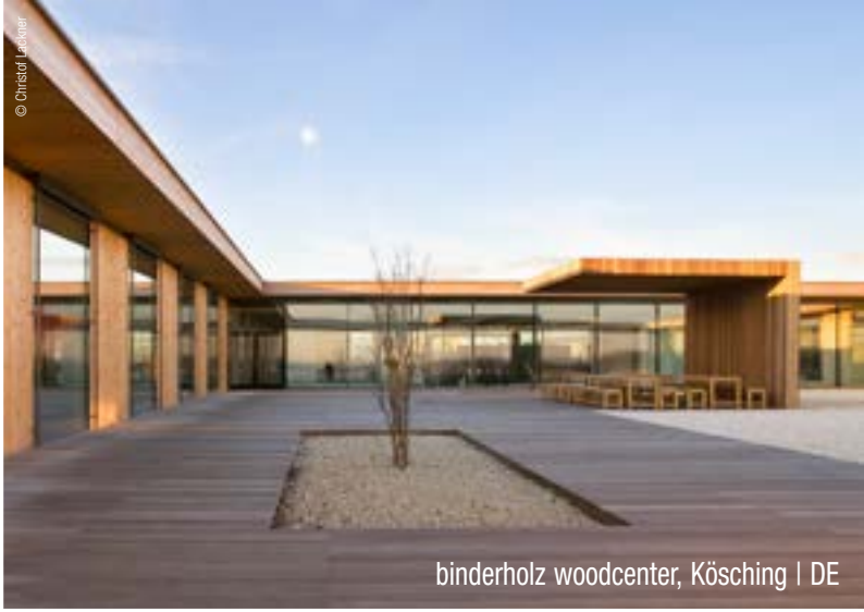
binderholz woodcenter, Kösching | DE