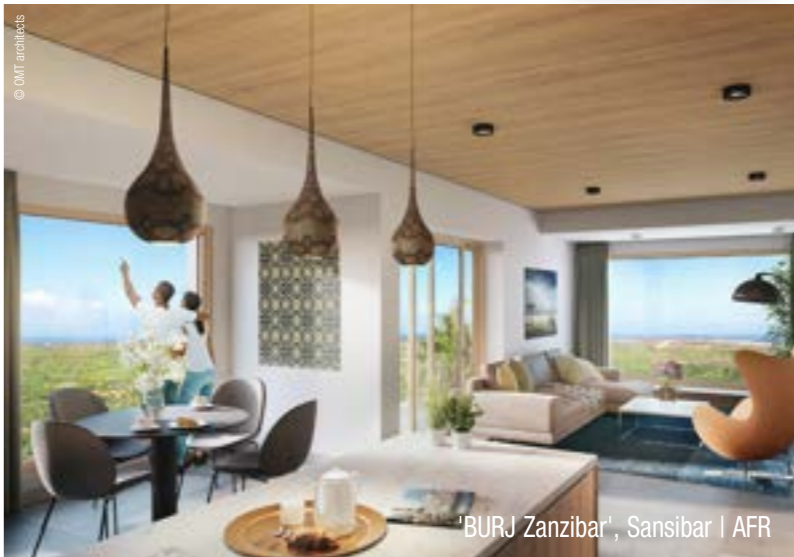
'BURJ Zanzibar', Sansibar | AFR