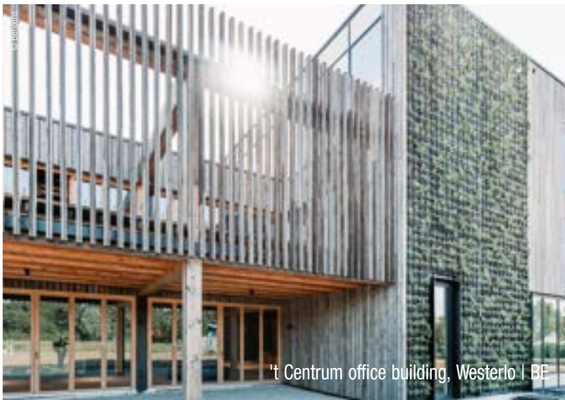
't Centrum office building, Westerlo | BE