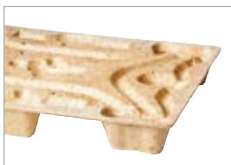
binderholz Pressboard pallets PSP