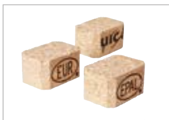
Pressed pallet blocks