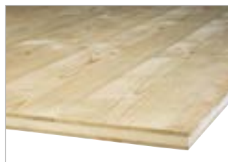
Solid wood panels