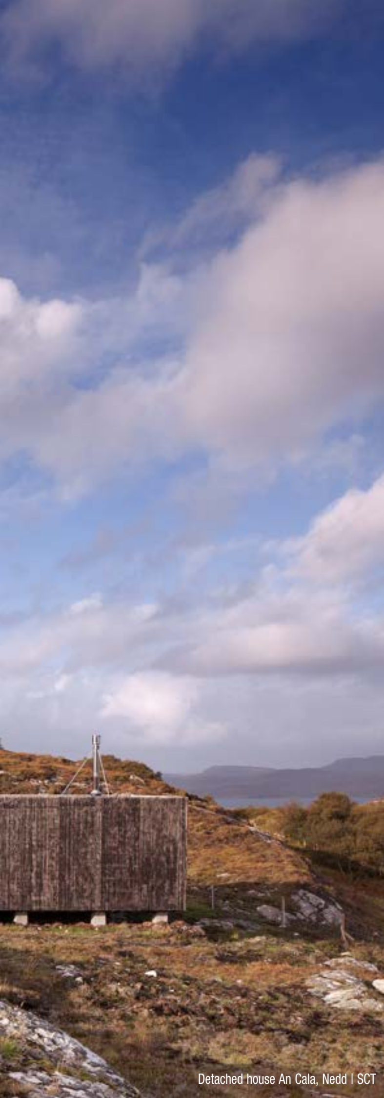
Detached house An Cala, Nedd | SCT