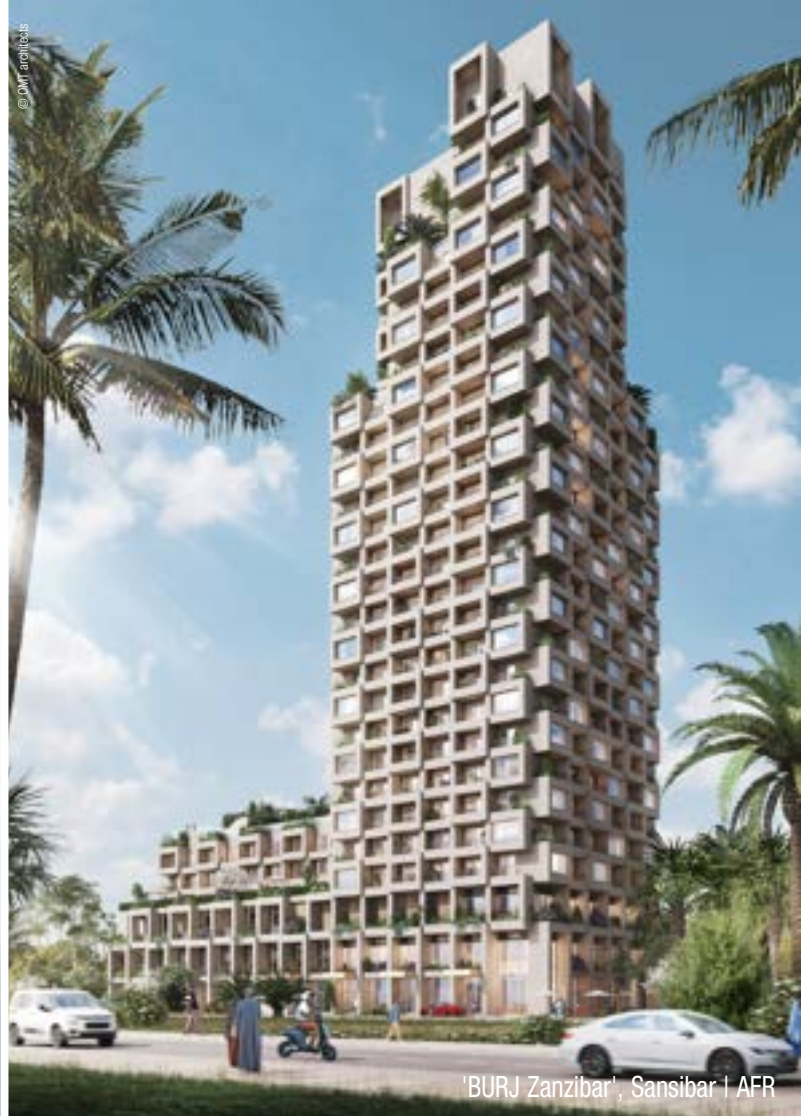
'BURJ Zanzibar', Sansibar | AFR