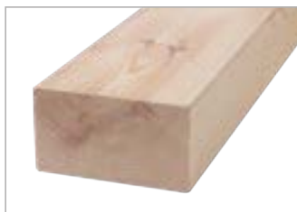
Solid structural wood KVH®