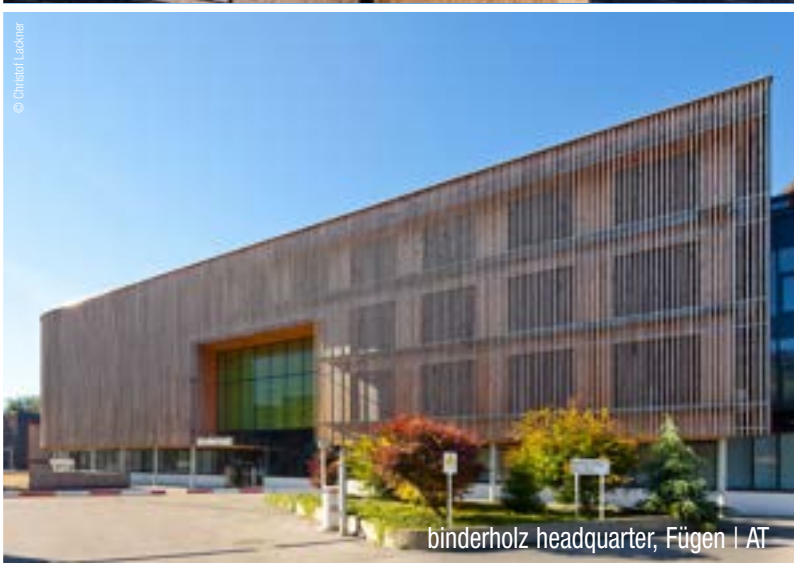
binderholz headquarter, Fügen | AT