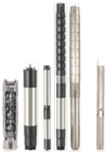
Deep Well Submersible Motors & Pumps