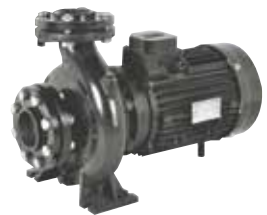
Short & Long Coupled End Suction Pumps