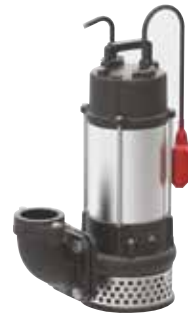
Sewage and Drainage Pumps