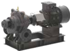
Split Case Pumps