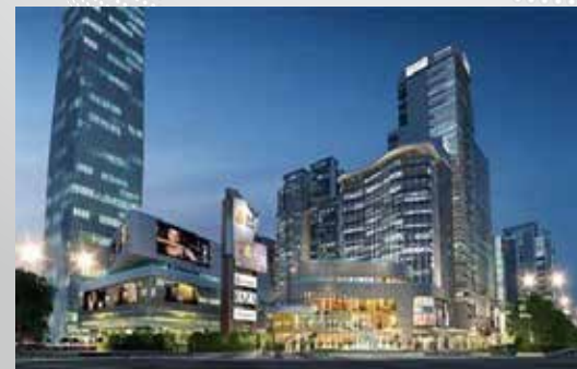
Zhongshan R&D Center