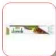
DAMAK MILK STICK 18GR