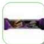
ÜLK ÇİKOLATALI GOFRET EXTRA BITTER 45GX18X6