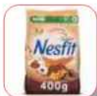
NESFIT CHOCOLATE CORNFLAKES 400GR