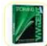
VIVIDENT STORMING 33 GR GREEN MINT