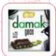
NESTLE DAMAK NIGHT 60GR