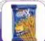
CRAX WITH CHEESE 80G