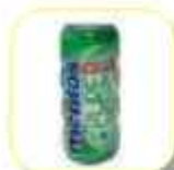
MENTOS PURE FRESH GREEN MINT 30GR