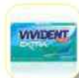
VIVIDENT EXTRA MINT 26GR