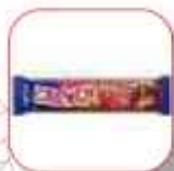
CRUNCH Patt WAFER 27 GR