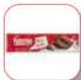
NESTLE TABLET MILK BATON 30GR