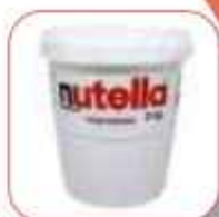
Nutella 3 Kg