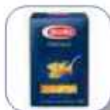
BARILLA FARFELLE 500GR