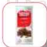
NESTLE TABLET MILK 65GR