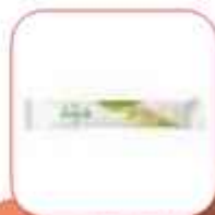
NESTLE DAMAK INCI STICK 18GR