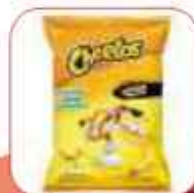
CHEETOS CHEESE 80G