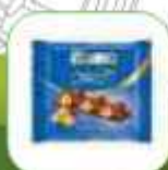
ÖLKER TABLET ÇİKOLATA FINDIK RÜYASI 75GR