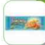
ÖLKER SAKLIKÖY MILK CREAM SANDWICH BISCUIT 100GR