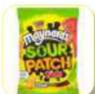
SOUR PATCH 160 GR KIDS