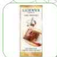
GODIVA CHOCOLATE CARAMEL LION 86GR