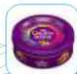
QUALITY STREET 410 GR