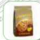
HANIMELLER ÇİKODAMLA POŞET 150GR