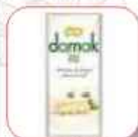
DAMAK INCI TABLET 70 GR