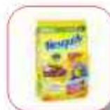
NESQUIK CORNFLAKES 225 GR