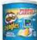
PRINGLES 40 GR SALT & VINEGAR