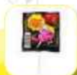
CHUPA CHUPS 3D SKULL 15GR