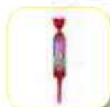
CHUPA CHUPS MELODY POPS 15GR