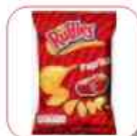
RUFFLES PAPRIKA 255G