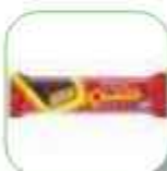
ÖLKER ÇİKOLATALI GOFRET 36GRx36x6