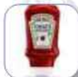
HEINZ KETCHUP 460 GR