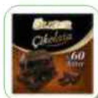
ÖLKER TABLET BITTER %60 60 GR