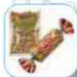
TWIX MINIATURES 10KG