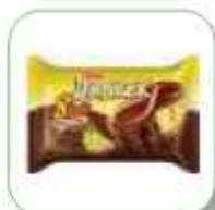
DANKEK 8 CAKE CHOCOLATE %BANANA 55GR