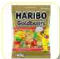
HARIBO GOLD BEARS 160 GR