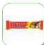
ÇÖKONAT KAPL. GOFRET 33GRx24x6