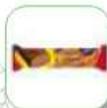
ÖLKER ÇİKOLATALI GOFRET KARAMELİZE BİSKÜVİ 30GRx36x6