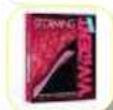
VIVIDENT STORMING 33 GR MINT STRAWBERRY