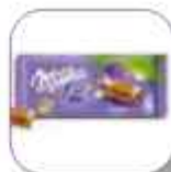
MILKA HAZELNUT 100GR