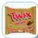
TWIX MINIS 170 GR