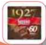
NESTLE 1927 BITTER 60% CACAO 60GR