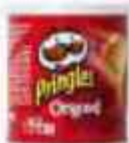
PRINGLES 40 GR ORIGINAL