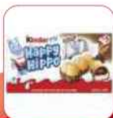
KINDER HAPPY HIPPO 5 PACK 103,5 GR