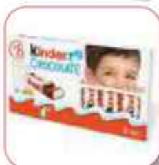
KINDER CHOCOLATE T8 100GR