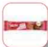
NESTLE CLASSIC WAFER 27g