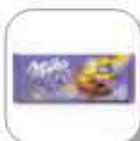
MILKA SANDWICH TUC 100 GR