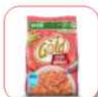
GOLD CORN FLAKES STRAWBERRY 310GR