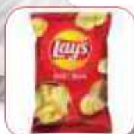
LAY'S CHIPS SALT 140G