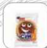
CIN ORANGE 25G