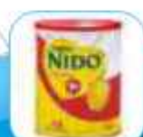
NIDO BABY MILK 1800GR