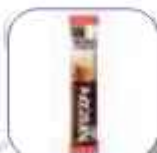
NESCAFE CAPPUCCINO 12(24x14g)