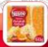
NESTLE TABLET WHITE ORANGE ALMOND 60GR