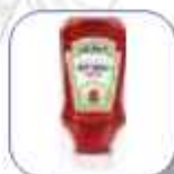
HEINZ HOT CHILI 245 GR