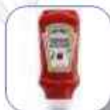
HEINZ KETCHUP 700 GR