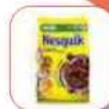
NESQUIK CORNFLAKES 450GR