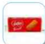
LOTUS BISCUIT 250 GR