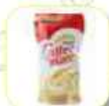
COFFEE-MATE ECOPAKET 200GR