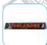
TOBLERONE DARK 100 GR