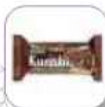
BURÇAK KURABI BISCUIT 198G