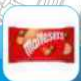
MALTERS 37 GR