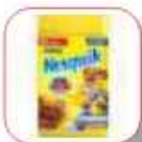
NESQUIK POWDER 420GR