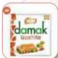
NESTLE DAMAK CARAMEL KROKAN 60GR