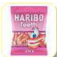
HARIBO TEETH 80 GR