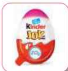
KINDER JOY 20GR