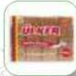
ÖLKER PÖTİBÖR 800 GR