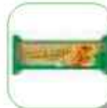
HANIMELLER HAZELNUT RULO BISCUIT 82GR