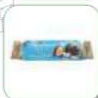
GODIVA CHOCOLATE DOMES WITH COCONUT 30GR