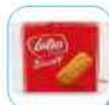
LOTUS BISCUIT 125 GR