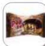
POPKER CACAO 60G