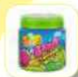
BIG BABOL FANTASTIC WORLD DINOSAUR EGGS 90GR