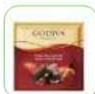
GODIVA DARK CHOCOLATE ROASTED ALMOND 60 GR