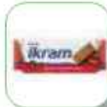
İKRAM CHOCOLATE CREAM BISCUIT 84GR