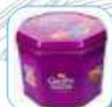
QUALITY STREET 2.5 GR