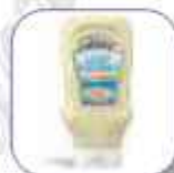
HEINZ LIGHT MAYONNAISE 420 GR