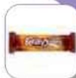
ETİ BENIMO CHOCOLATE 89GR