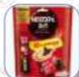
NESCAFE 3IN1 40(10x17.5g)