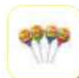
CHUPA CHUPS XXL TRIO 29GR