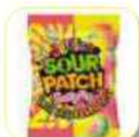
SOUR PATCH 160 GR WATERMELON