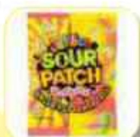
SOUR PATCH 40GR WATERMELON