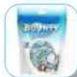
BOUNTY MINIATURES 10KG