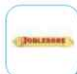
TOBLERONE MILK 50 GR