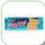
HAYLAYF BISCUIT 64GR