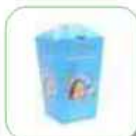
GODIVA CHOCOLATE DOMES WITH COCONUT 123GR