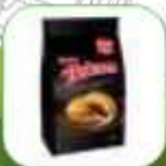
BISKREM ÇACAO 200 GR