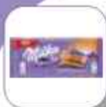
MILKA ALMOND CRISPY CREME 90 GR