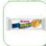
ÖLKER SANDWICH BISCUIT 61 GR