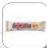
MAXIMUS WHITE PEANUT BAR 36G