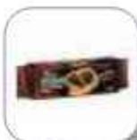
BURÇAK BISCUIT WITH MILK CACAO CREAM 100GR