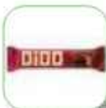
DIDO SÖTLO ÇİKOLATALI GOFRET 35GRx24x6