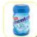
MENTOS PURE FRESH MINT 60GR