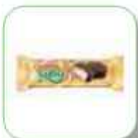
HALLEY MINI GRANOLLO 66GR