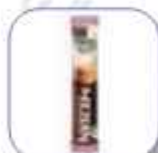
NESCAFE WHITE CHOCOLATE MOCHA 12(24x19.2g)