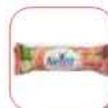
NESFIT BAR CARAMEL 23.5GR