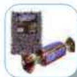
SNICKER MINIATURES 10KG