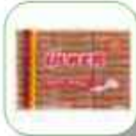
ÖLKER PÖTİBÖR 450 GR