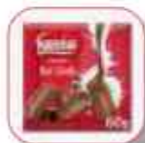
NESTLE TABLET MILK 60GR