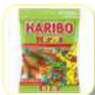
HARIBO WORMS 80 GR