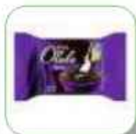
ÖLKER O'LALA SUFLE CAKE 70 GR