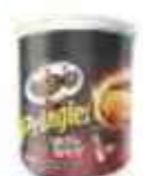
PRINGLES 40 GR HOT & SPICY