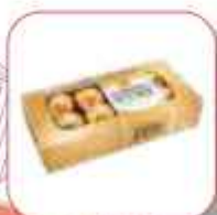
FERRERO ROCHER T8 100GR