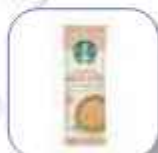
STARBUCKS LATTE 20(10x14g)