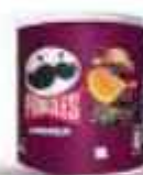
PRINGLES 40 GR BARBEQUE