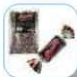
MARS MINIATURES 10KG