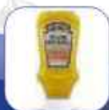
HEINZ HARITAL 240 GR