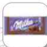
MILKA OREO 100GR