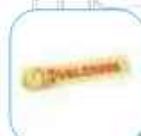
TOBLERONE MILK 100 GR