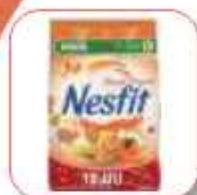
NESFIT FRUIT CORN FLAKES 400GR