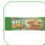
9 KAT TAT WITH HAZELNUT CREAM 114GR