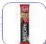
NESCAFE 3IN1 10(56x17.5g)