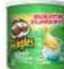
PRINGLES 40 GR SOUR CREAM & ONION