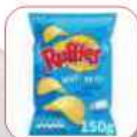
RUFFLES SALT 150G