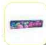
BIG BABOL STICK 25 GR WITH ASSORTMENT