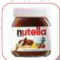
Nutella 630 Gr