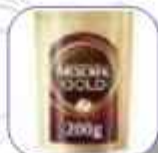
NESCAFE GOLD ECOPAKET 200GR