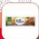
NESFIT BAR BANANA-CHOCOLATE 23.5 GR