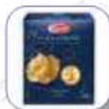
BARILLA FETTUCCINE 500GR