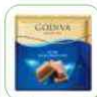
GODIVA EXTRA MILK CHOCOLATE 60 GR