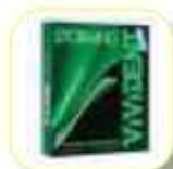
VIVIDENT STORMING 33 GR MINT