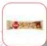
NESTLE 1927 MILK WAFER 28GR