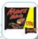
MARS MINIS 170 GR