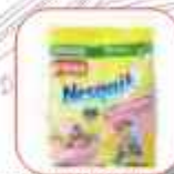
NESQUIK STRAWBERRY CORNFLAKES 310GR