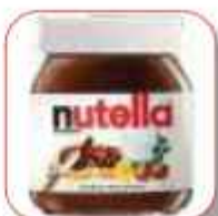
Nutella 750 Gr