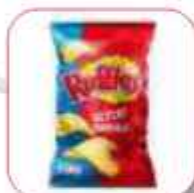
RUFFLES KETCHUP 150G