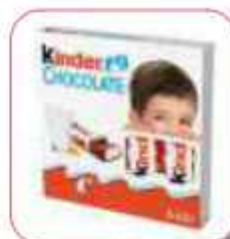
KINDER CHOCOLATE T4 50GR