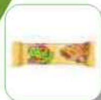
KAT KAT TAT HAZELNUT 25GR