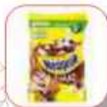
NESQUIK DUO CORNFLAKES 310GR