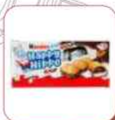
KINDER HAPPY HIPPO 20,7GR