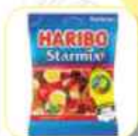
HARIBO STARMIX 80 GR