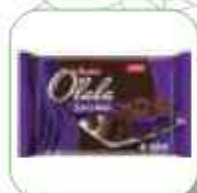
ÖLKER O'LALA SUFLE MINI 162 GR