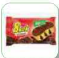
DANKEK 8 CAKE CHOCOLATE 55GR