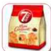
7 DAYS CROISSANT CACAO 185 GR