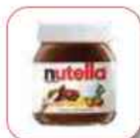
Nutella 400 Gr