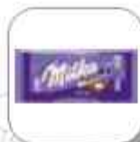
MILKA HAPPY COW 100GR