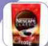
NESCAFE CLASSIC 100GR