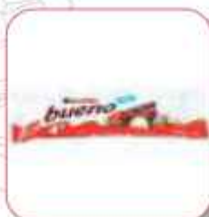
KINDER BUENO T2*5 215 GR