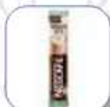
NESCAFE LATTE 12(24x17g)