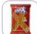
CRAX SADE ÇUBUK KRAKER 85G