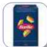
BARILLA GNOCCHETTI 500 GR