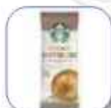
STARBUCKS CAPPUCCINO 20(10x14g)