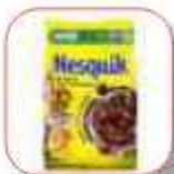
NESQUIK CORNFLAKES 700GR