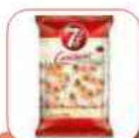
7 DAYS CROISSANT CACAO 380GR (38GR*10)