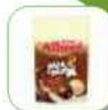
ALBENİ MIX&MAX 100GR