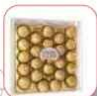
FERRERO ROCHER T24 300GR DIAMANTE