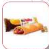
NUTELLA B-READY T2 44GR(2*22GR)