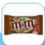
M&M CHOCO 45 GR