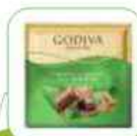
GODIVA MILK CHOCOLATE PISTACHIO & CARAMEL 60 GR