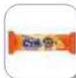
CIN LOKMALIK 114G