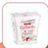
RAFELLO T23 230GR