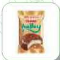
HALLEY CHOCOLATE COATED BISCUIT 30GR