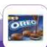
OREO MILK CHOCOLATE 246 GR