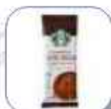
STARBUCKS MOCHA 20(10x22g)