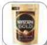
NESCAFE GOLD ECOPAKET 100GR