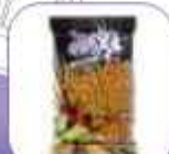
CRAX CHILLI LIME 50G