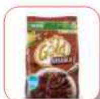
GOLD CORN FLAKES CHOCO 310GR