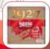
NESTLE 1927 EXTRA MILK 60GR