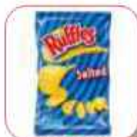
RUFFLES SALT 70G*5