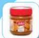
LOTUS SPREAD 200GR