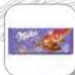
MILKA SANDWICH LU 87 GR