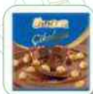
ÖLKER TABLET HAZELNUT 65 GR