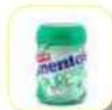
MENTOS PURE FRESH GREEN MINT 60GR