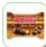
ALBENİ TANE TANE 40GRx12