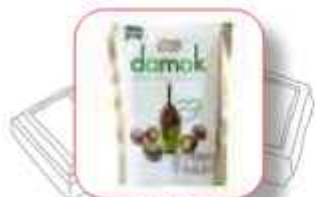
DAMAK DRAJE 50GR