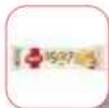
NESTLE 1927 LATTE WAFER 30GR