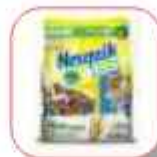
NESQUIK ÇIKOKARE CORNFLAKES 310GR