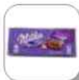
MILKA RAISIN&NUT 100GR