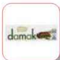
DAMAK MILK BATON 30GR