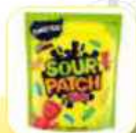
SOUR PATCH 40GR KIDS