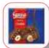
NESTLE TABLET HAZELNUT 60GR