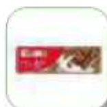
ÖLKER BATON MILK CHOCOLATE 30GR