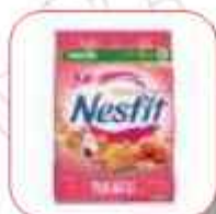
NESFIT RED FRUIT CORN FLAKES 400GR