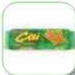
ÇİZLİ KRAKER 70GR