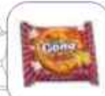
GONG WITH SPICY AND CHEESE 34G