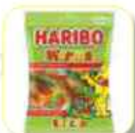
HARIBO WORMS 160 GR