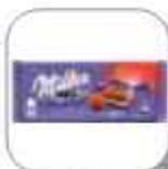
MILKA STRAWBERRY/ YOGHURT 100GR