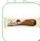
ÖLKER LAVİVA 35GRx24x6