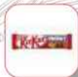
NESTLE KITKAT CHUNKY 38GR