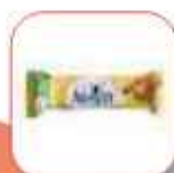
NESFIT BAR HONEY & ALMOND 23.5 GR