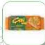
ÇİZLİ Çİ CHEESE SANDVIÇ KRAKER 82GR