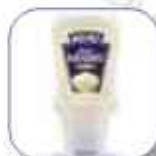
HEINZ MAYONNAISE 400 GR