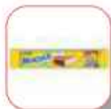
NESQUIK WAFER 26,7 GR