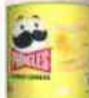
PRINGLES 40GR CHEESY & CHEESE