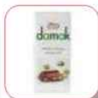
DAMAK TABLET 70GR