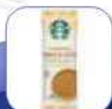
STARBUCKS VANILLIA LATTE 20(10x21.5g)