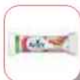
NESFIT BAR STRAWBERRY 23.5GR