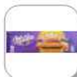
MILKA CHOCO&BISCUIT 300GR