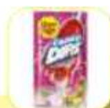
CHUPA CHUPS CRAZY DIPS STRAWBERRY 16GR