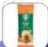
STARBUCKS CARAMEL LATTE 20(10x23g)