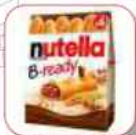
NUTELLA B-READY T6 132GR(6*22GR)