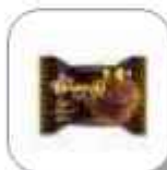
BROWNI GOLD CACAO CAKE 45G