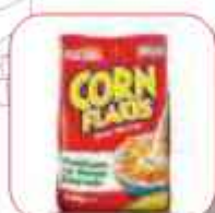
GOLD CORN FLAKES 650GR