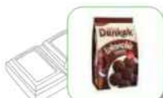
DANKEK LOKMALIK CACAO 160GR