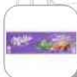
MILKA WHOLENUTS 250GR