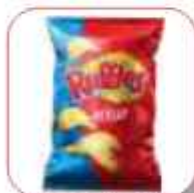
RUFFLES KETCHUP 70G*5