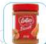
LOTUS SPREAD 400GR