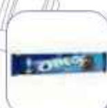
OREO ORIGINAL 154GR