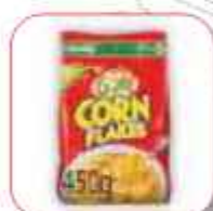
GOLD CORN FLAKES 450GR