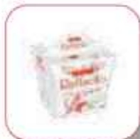
RAFELLO T15 150GR