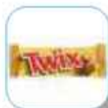
TWIX 50 GR