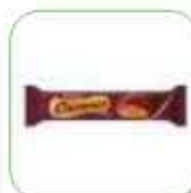
CARAMIO BATON ÇİKOLATA 32GR