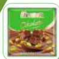
ÖLKER TABLET PISTACHIO 65 GR