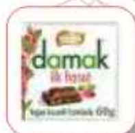
NESTLE DAMAK TABLET FIRST HARVEST PISTACHIO 60GR