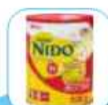
NIDO BABY MILK 900GR