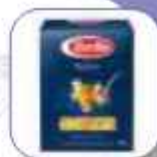
BARILLA FUSILLI 500GR