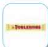
TOBLERONE MILK 35 GR