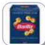
BARILLA FARFELLE TONDE 500GR