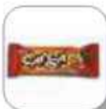
ETİ CANGA 45G