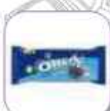
OREO ORIGINAL 44GR