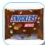
MARS MINIS 170 GR