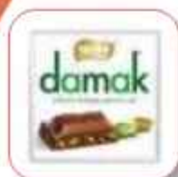
NESTLE DAMAK MILK 60GR