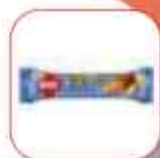
NESTLE 1927 HAZELNUT WAFER 31GR