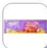
MILKA RAISIN& HAZELNUT 270GR