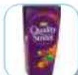
QUALITY STREET 255 GR