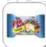
POPKER COCONUT 60G