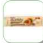
SAKLİKÖY CHOCOLATE & MILK BISCUIT 100GR