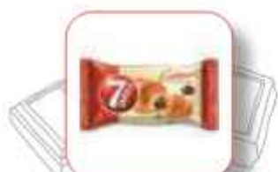
7 DAYS CROISSANT CACAO 60GR