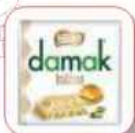
NESTLE DAMAK BAKLAVA 60GR