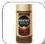
NESCAFE GOLD JAR 200GR