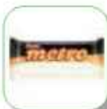
METRO KAPLAMALI BAR 36GRx24x6