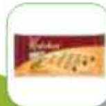
RULOKAT WAFER ROLLS WITH HAZELNUT CREAM 42GR