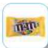
M&M PEANUT 45GR