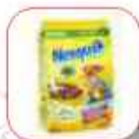
NESQUIK CEREALS 150GR