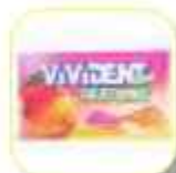
VIVIDENT FRUIT SWING 26GR