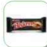
BISKREM ÇACAO BISCUIT 100GR