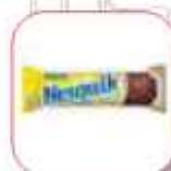
NESQUIK BAR 25GR