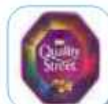
QUALITY STREET 900 GR