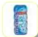
MENTOS PURE FRESH MINT 30GR