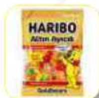
HARIBO GOLD BEARS 80 GR