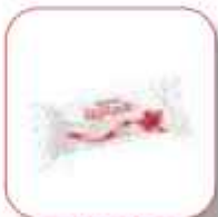
RAFELLO T4 40GR