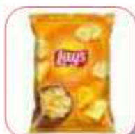
LAY'S CHEESE 60G*5