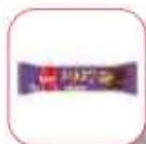
NESTLE 1927 BITTER WAFER 28 GR