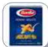
BARILLA PENNE RIGATE 500GR