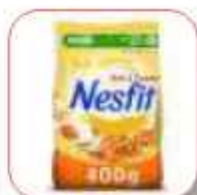
NESFIT HONEY & ALMOND CORNFLAKES 400GR