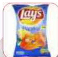
LAY'S PAPRIKA 200G