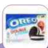
OREO DOUBLE CREAM 170GR