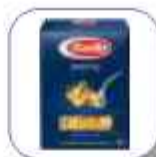
BARILLA PIPETTE 500GR