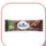
NESFIT CHOCOLATE BAR 23.5 GR