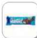
ETİ WANTED BUMBA 32G