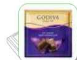
GODIVA DARK CHOCOLATE 72% COCOA 60 GR