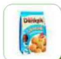
DANKEK LOKMALIK COCONUT 160 GR