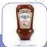
HEINZ BARBEQUE SAUCE 250 GR