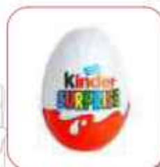
KINDER SURPRISE 20GR