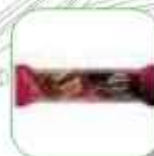
ÖLKER ÇİKOLATALI GOFRET BITTER 36GRx24x6