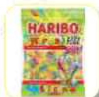
HARIBO FIZZ SOUR WORMS 70 GR