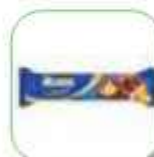
ÖLKER ÇİKOLATA FINDIK RÜYASI 40,5GR