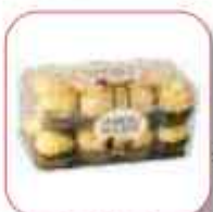
FERRERO ROCHER T16 200GR