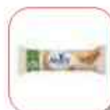
NESFIT BAR WHITE CHOCOLATE 22.5GR