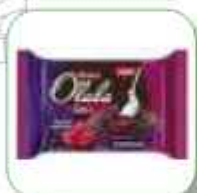
O'LALA FRAMBUZALI SUFLE CAKE 70 GRX12