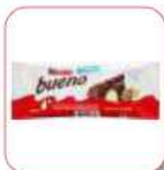
KINDER BUENO T2 43GR