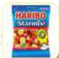
HARIBO STARMIX 160 GR