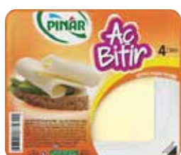
AÇ BİTİR SLICED KASHKAVAL

Those who want to have a healthy and practical diet while the day flows fast can experience ease with Pinar Aç- Bitir Sliced Cheese 60g.