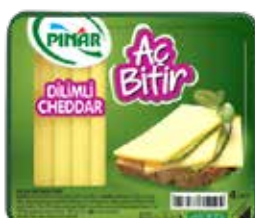
AÇ BİTİR SLICED CHEDDAR